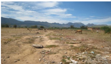
Landscape before and after